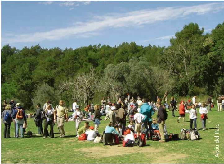
Arxiu del Parc